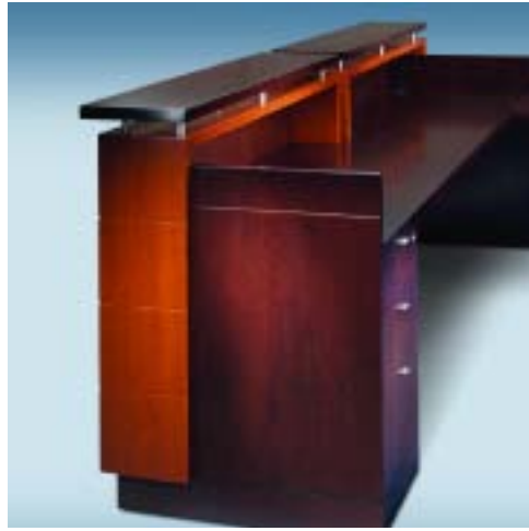
Wood transaction TS2 brushed aluminum raisers