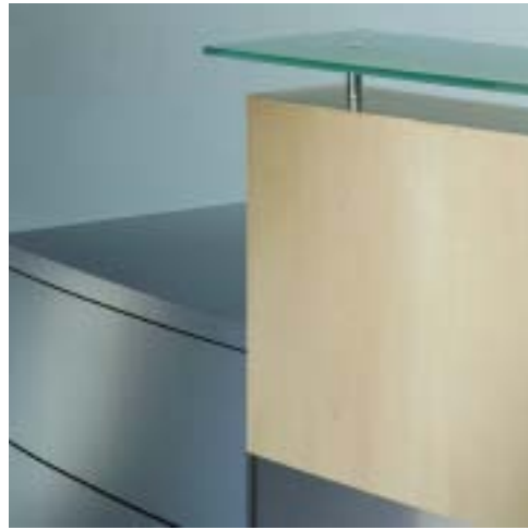
Glass, metal, veneer and laminate contrasts