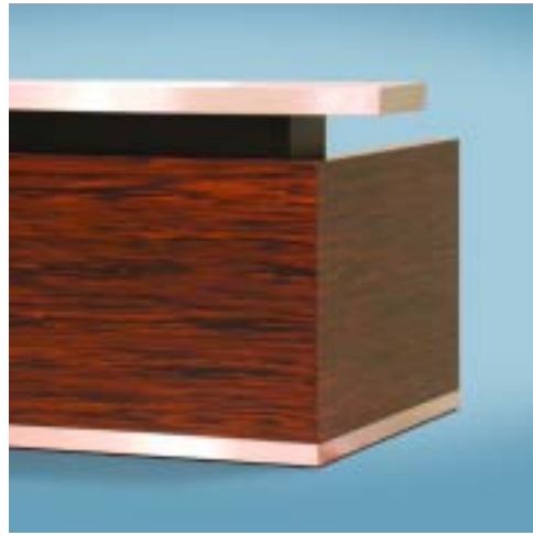
Brushed aluminum transaction and kickbase