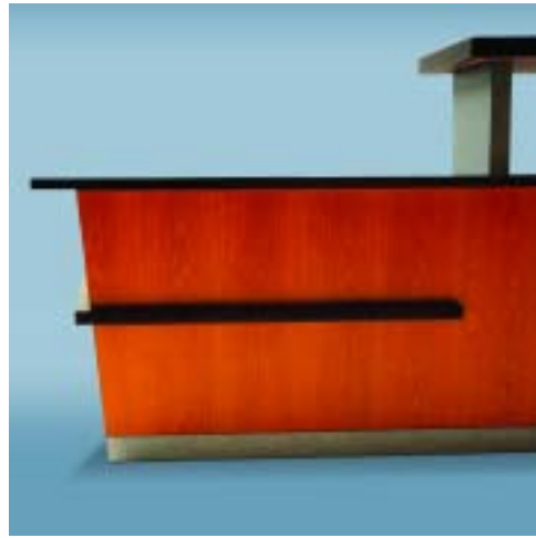
Angle end panel