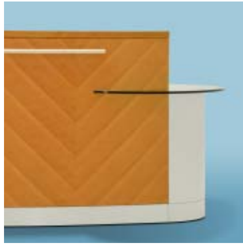
Brushed aluminum hand rail, half-round base and kickbase