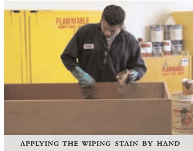
APPLYING THE WIPING STAIN BY HAND

and lacquers, and a better finish match from one element to another.