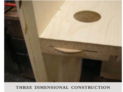
THREE DIMENSIONAL CONSTRUCTION

Look for that in the best quality casegoods.