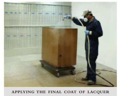
APPLYING THE FINAL COAT OF LACQUER

Equally important; Woodtech applies the topcoat of lacquer in a positive air flow environment; so the finish is virtually dust free.