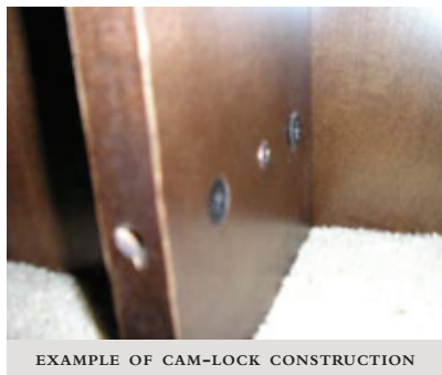
EXAMPLE OF CAM-LOCK CONSTRUCTION

Woodtech Utilizes Three-Dimensional Construction — So, why is Woodtech’s finish better than the others? Most of the eastern manufacturers do flat-line finishing. Panels are finished on a conveyor system prior to assembly. Typically, this results in a very nice finish, but it also restricts the assembly process because the components come to the assembly area already finished. Furniture then has to be assembled using exposed fasteners; cleats and cam-locks. See below.