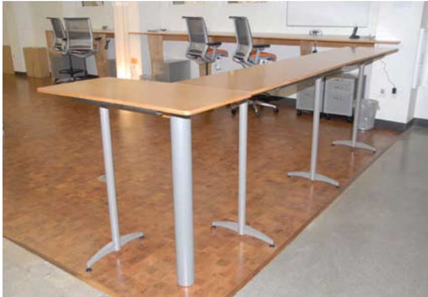
Modular furniture with 11-ply birch tops.