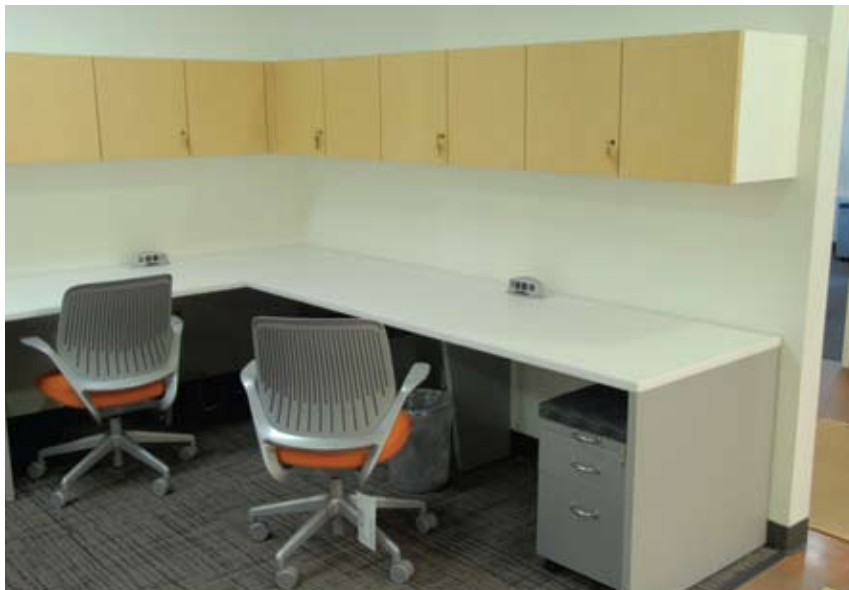
Laminate workstations with voice-power-data.